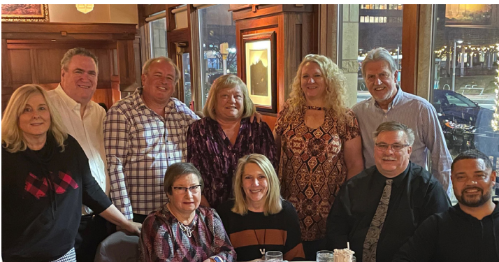
DC Chapter Dinner

I hope you will consider joining us at the State Chapter Convention in Northbrook from May 12th-14 th . We are going to offer some training programs, and plan to have District Managers and POOMS in attendance, to answer questions and concerns in person. Your state board has been working hard to organize this great meeting, and planning for the attendees to have some fun, too. We are growing our membership with many new, young members, who can have the opportunity to learn from more established leaders in the USPS. I hope you all will make time to attend – I promise it will be worth it!