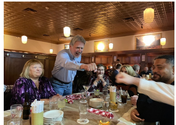
A Celebratory Fist Bump for a Job Well Done!